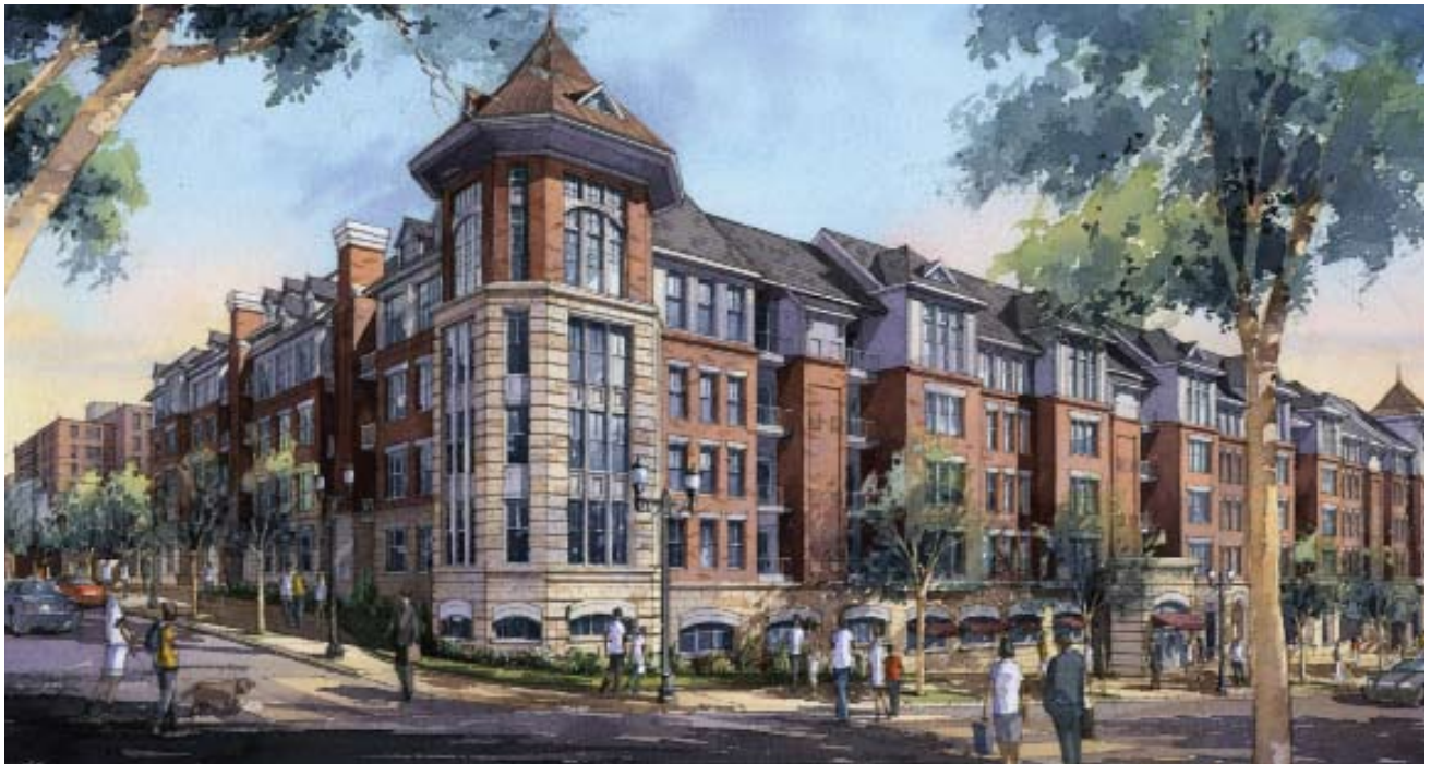
Glen View House