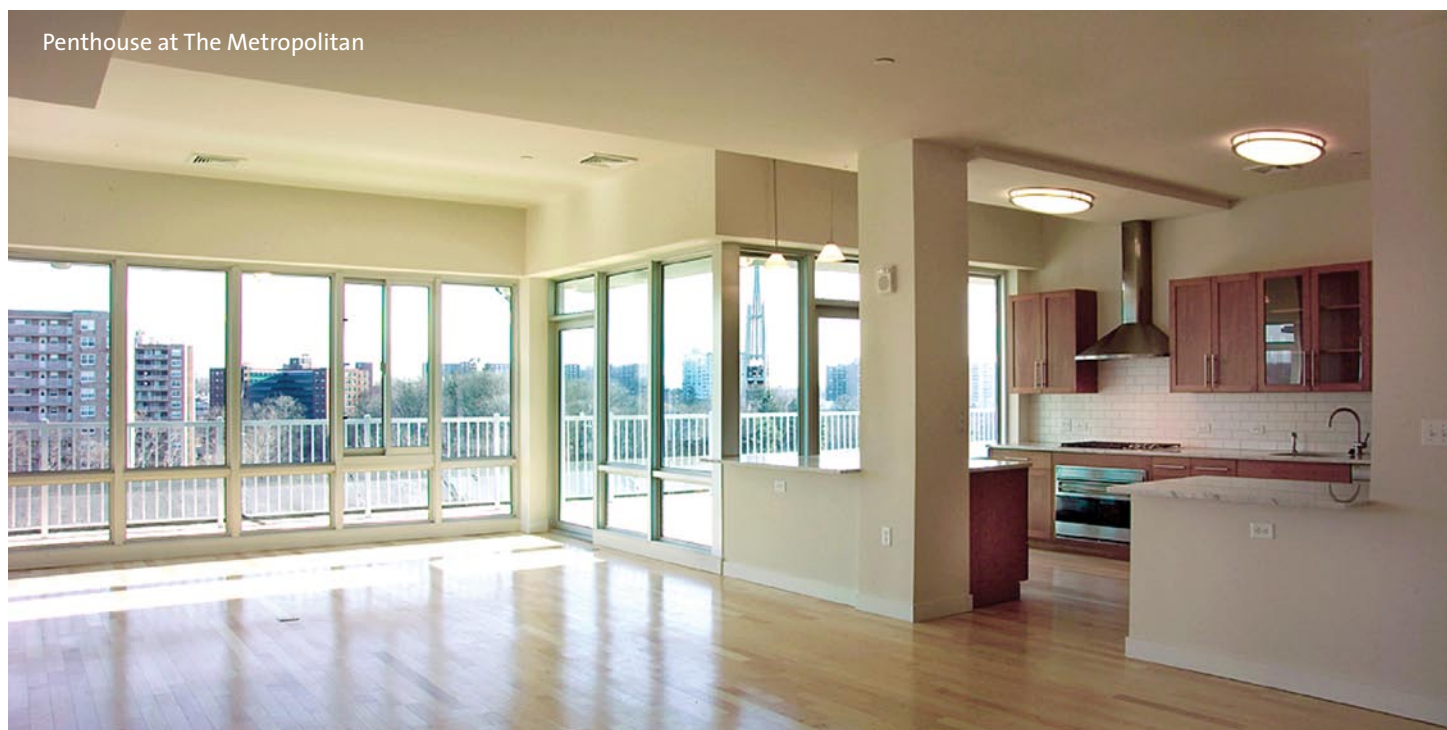
Penthouse at The Metropolitan