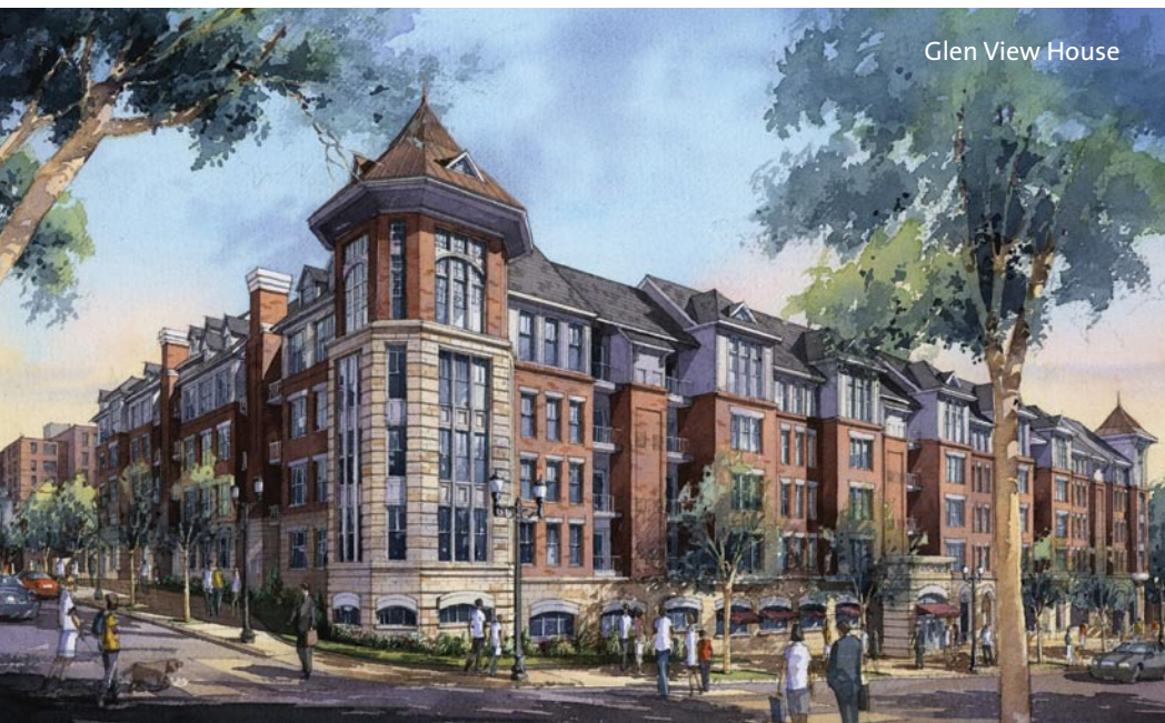
Glen View House